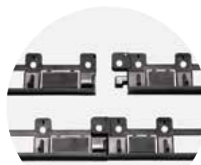
« TWIST & LOCK » SYSTEM