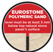
Maximum joint width 3.5 cm