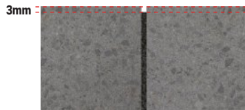
PAVERS OR NATURAL STONES WITHOUT CHAMFER

Maximum joint width for traditional base 10 cm