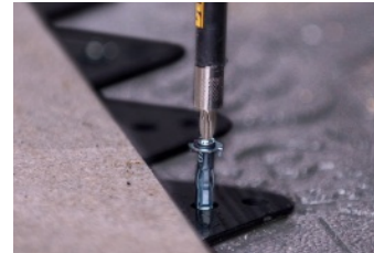
5/8" (15mm) height

For use on: GATOR TILE EDGE are use to support, stabilize and offer a strong lateral support for the perimeter of a porcelain tile installation for a patio, sidewalk, pool surrounding & terrace, fasten to the Gator Base panels with the help of the Gator Base Screws .