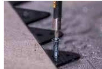
5/8" (15mm) height

For use on: GATOR TILE EDGE are use to support, stabilize and offer a strong lateral support for the perimeter of a porcelain tile installation for a patio, sidewalk, pool surrounding & terrace, fasten to the Gator Base with the help of the Gator Base Screws .