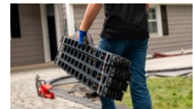
1 bundle = 96 linear feet.