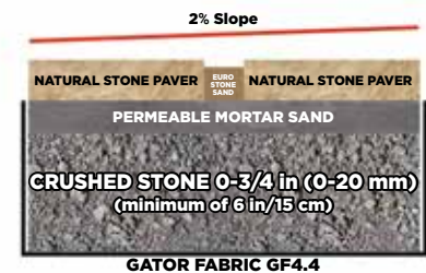
OVERLAY BASE SYSTEM