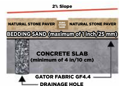
OVERLAY BASE SYSTEM