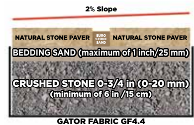
TRADITIONAL BASE SYSTEM

Sand or ASTM No. 9 Stone can be used under natural stone pavers