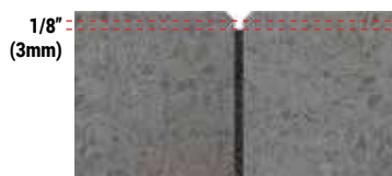
PAVERS OR NATURAL STONES WITH CHAMFER

POLYMERIC SAND REQUIREMENTS Minimum joint width: 1/8" (3 mm) Maximum joint width: 1" (2.5 cm) Minimum joint depth: 1 1/2" (38 mm)