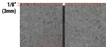
PAVERS OR NATURAL STONES WITHOUT CHAMFER